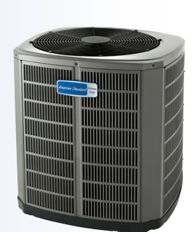
AccuComfort<sup>™</sup> Platinum 18