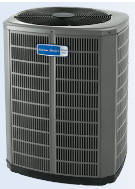
AccuComfort™ Platinum 20

American Standard Platinum air conditioners offer our highest combination of performance, efficiency, and temperature control. Built with American Standard's commitment to quality throughout, the Platinum line offers advanced energy-saving features like Duration<sup>™</sup> variable speed compressors and Spine Fin<sup>™</sup> coils.